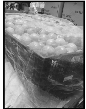
image above) to keep the fruit flies from landing on the fruit and laying their eggs. For more information visit: www.cdfa.ca.gov/plant/off/regulation.html ♦

The CDFA required Food Pantry-LAX to cover all fresh produce with mesh netting (see